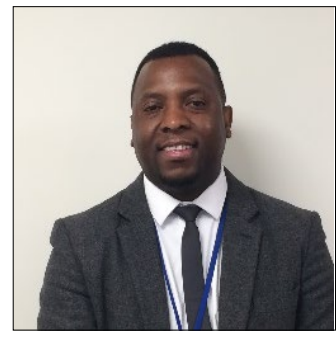
Our Safeguarding Contacts are: